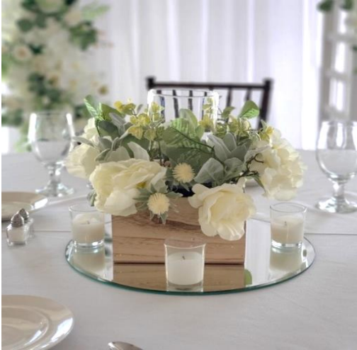
Floral Arrangement- $30 each