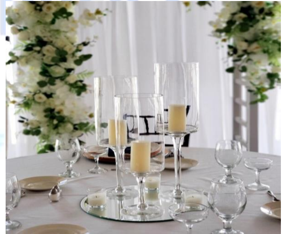
Set of 3 candle holders- $35 each