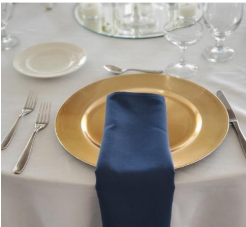
Gold charger- $2 each