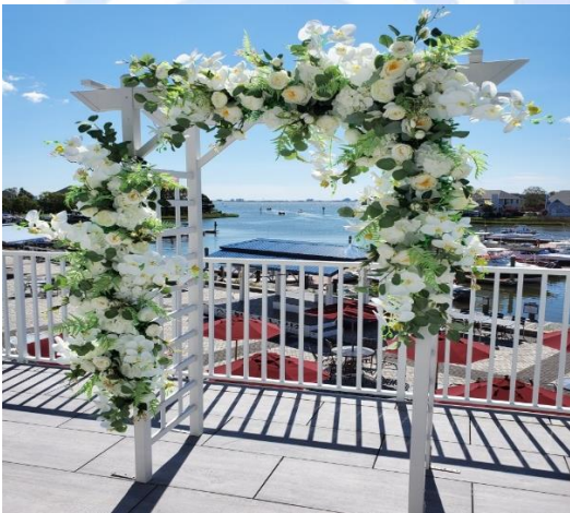
Arbor w/ flowers- $150