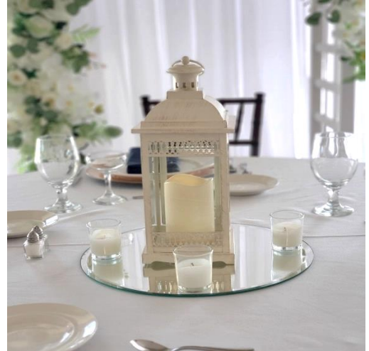
Lantern- $30 each