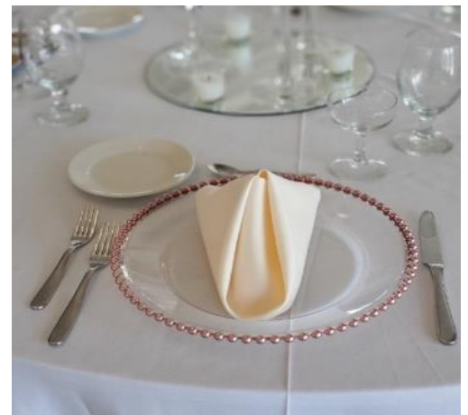
Pearl Charger- $3 each